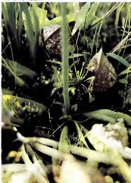
Figure 3. Growth point of anthocyanin free form of S. psittacina . Note complete lack of anthocyanin.